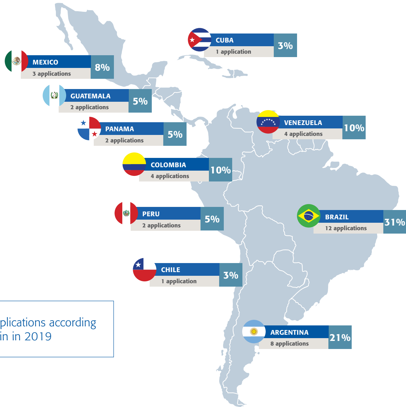
Distribution of applications according to country of origin in 2019